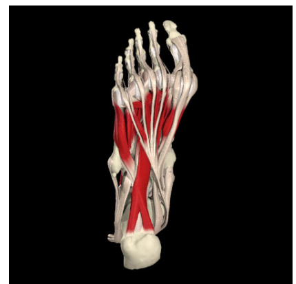
Interactive Foot and Ankle 2 © 2001 Primal Pictures Ltd