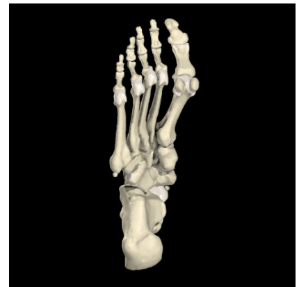
Interactive Foot and Ankle 2

It is important to realize that beneath the plantar fascia the muscles are arranged in layers, and each muscle within each layer has a different job or function. For example, some of the muscles attach all the way into the toes and act to flex and stabilize the toes, while other muscles attach into the other bones of the mid-foot to control and stabilize the arch of the foot. For the foot and ankle to work properly, and to prevent pain and injury, not only does there have to be adequate strength and flexibility of the foot and calf muscles, but these different layers of muscles need to be able to glide freely over one another during normal use.