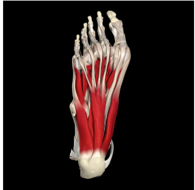
Interactive Foot and Ankle 2

As the muscles and fascia of the foot become strained and develop adhesions, they become very tight. As the tightness increases, the tissues begin to pull away from the heel where they attach,