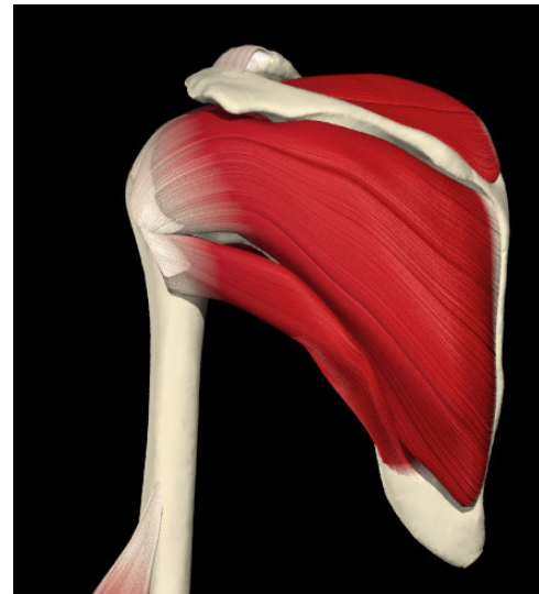
Interactive Shoulder © 2000 Primal Pictures Ltd.

As these scar tissue adhesions accumulate in the shoulder region, it places more and more strain on the muscles as they must now stretch and contract against these adhesions in an attempt to move and stabilize the shoulder. This places even further strain on the shoulder muscles, which in turn leads to more micro-trauma. Essentially a repetitive injury cycle is set-up causing continued adhesion formation and progressive shoulder dysfunction. As the cycle progresses the ability of the muscles to contract properly is affected and the stability of the shoulder becomes compromised. At this point it is not uncommon for the muscles to give way, resulting in a more severe and debilitating pain. In fact, many athletes come into our office explaining how they have hurt their shoulder during a routine task that they have done thousands of times before. When further